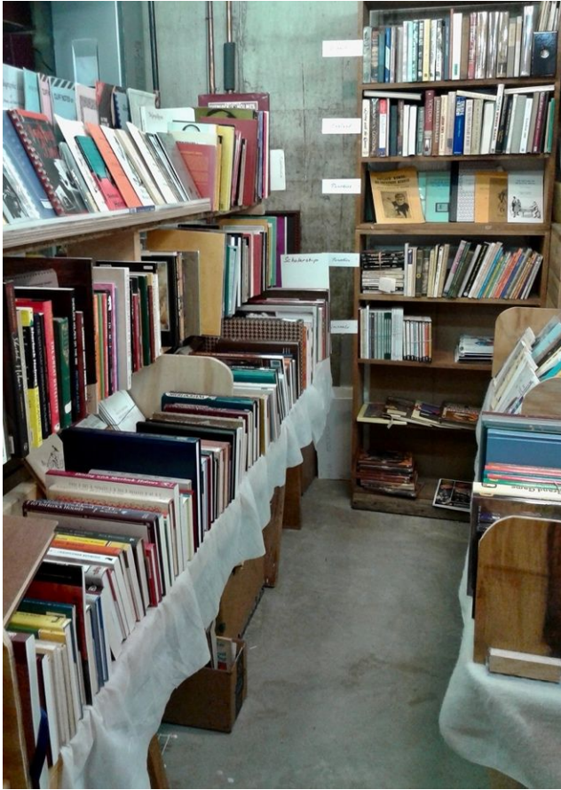
The shelves are packed for Denny Dobry's Open House!